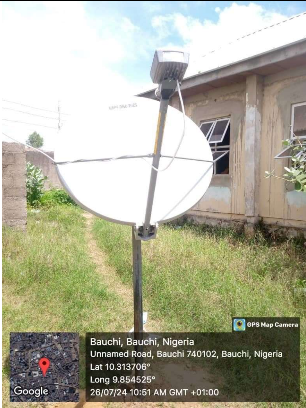
Installed VSAT Equipment