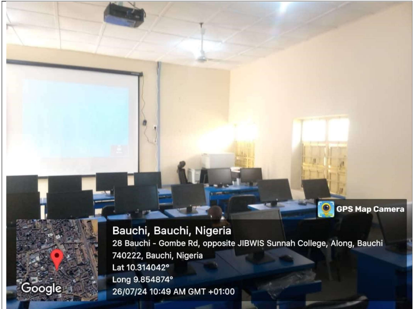
Interior View of the ICT Center