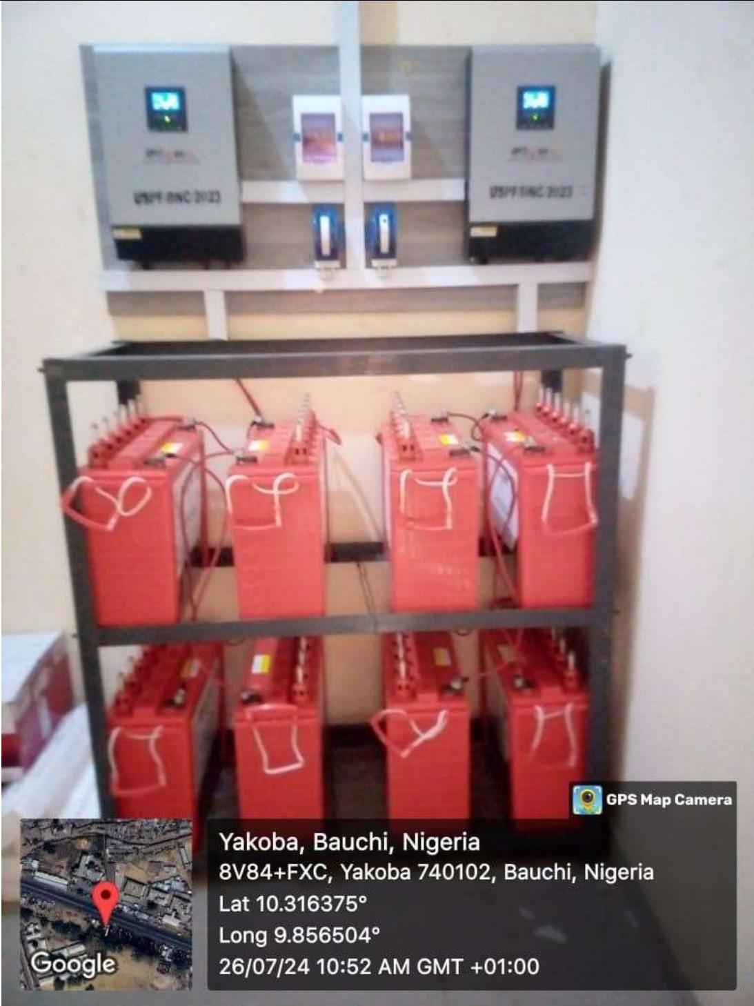
Installed Inverter and Batteries