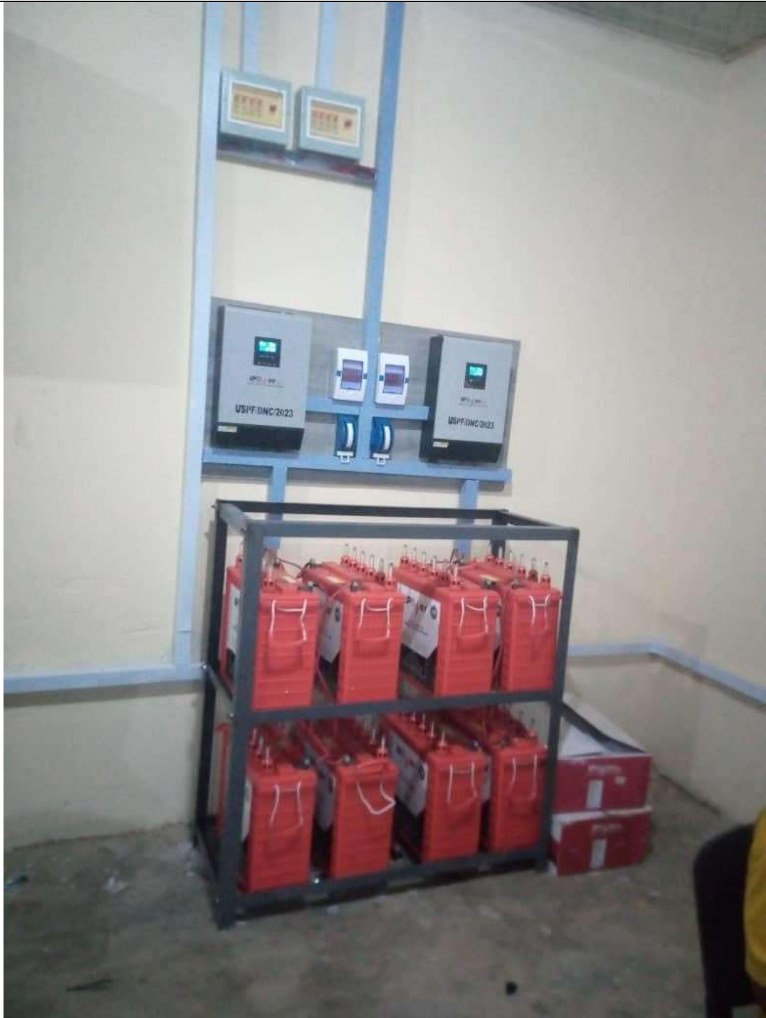
Installed Inverter and Batteries