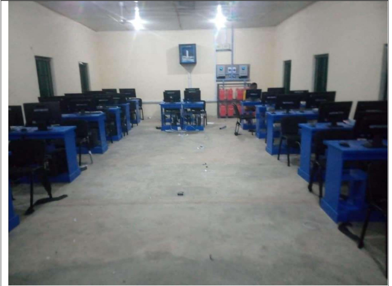
Interior View of ICT Center