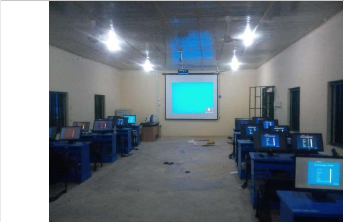
Interior View of ICT Center