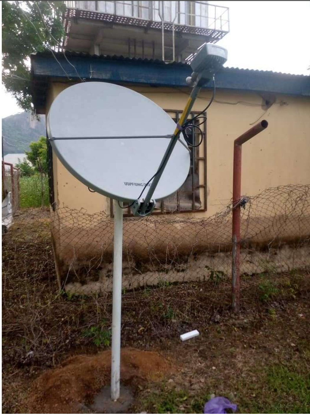
Installed VSAT Equipment